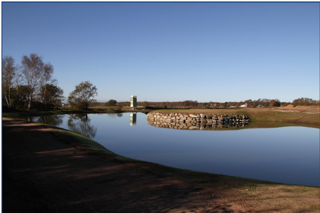
Halmstad Golf Arena