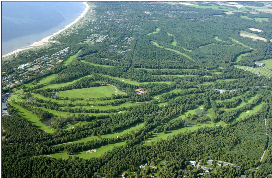
The 36 holes at Halmstad Golf Club

Please note: Details about times etc. will be given upon registration