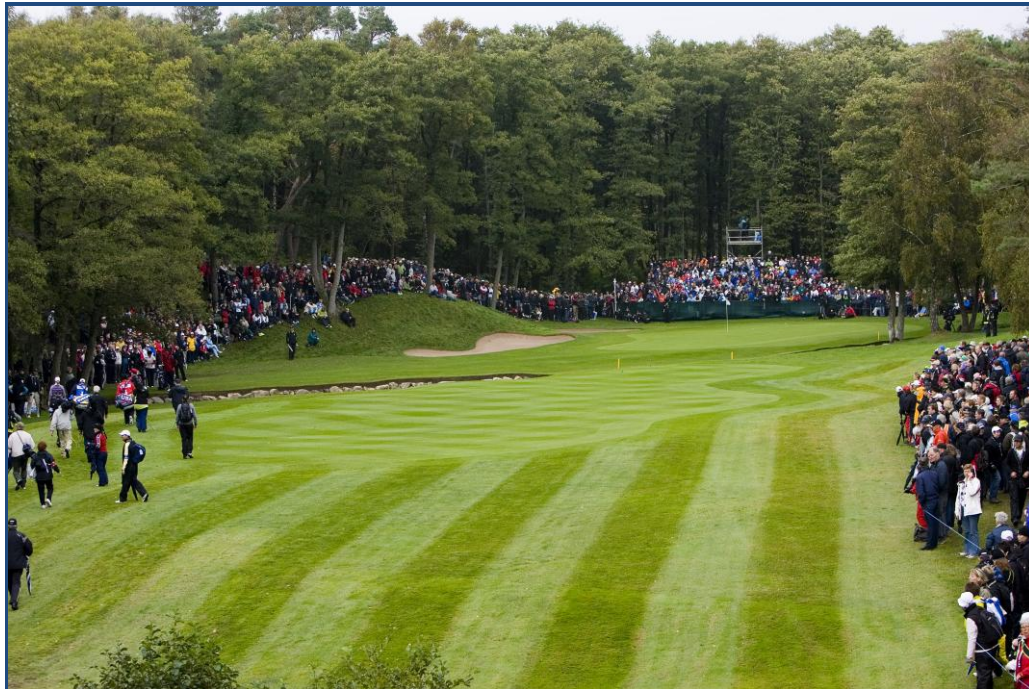
Hole 16, the famous par-3 hole at Halmstad Golf Club