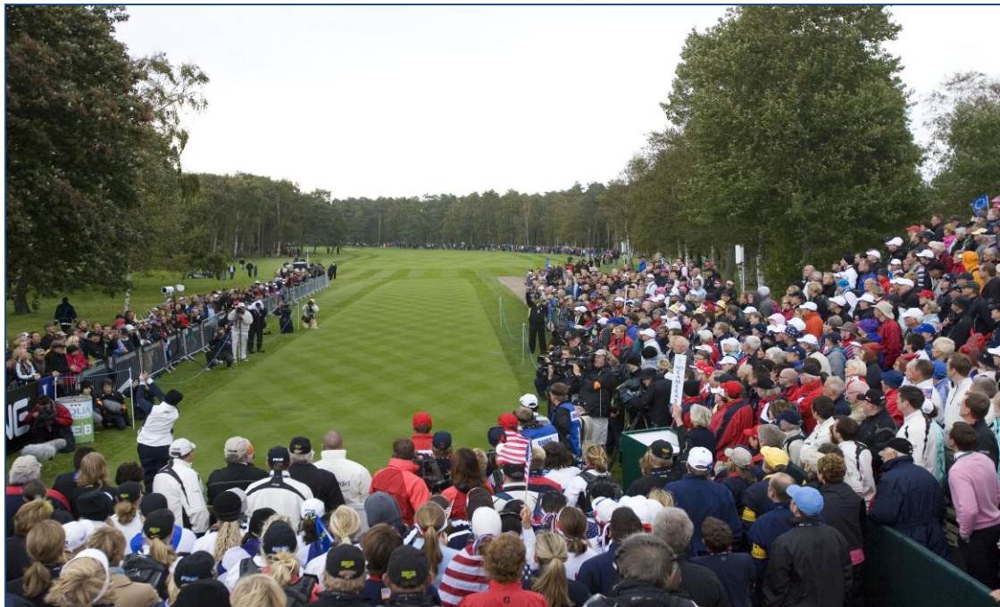
View of the first tee during Solheim Cup